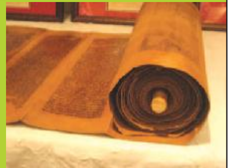
Torah scroll in sheepskin

BIBLE LEAGUE 2008 MINISTRY RESULTS: Covers over 60 countries