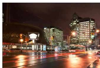
RTH, at King and Simcoe, was the venue for the Opening Night Gala Dinner

designed to support our Orchestra. In addition to fine dining, wine, and music, Gala attendees placed