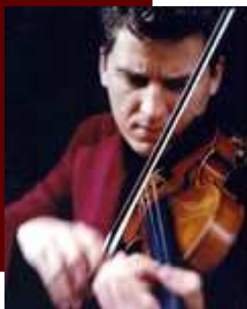
James Ehnes, the 2008 Gramophone Award winner for Best Concerto Recording of the Year