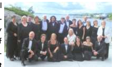
The 20-member, Toronto-based Elmer Iseler Singers

trious professional choral ensembles. The TSVC is a very proud supporter of the December 3 concert which forms part of the Afterworks Concert Series.