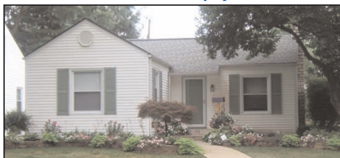
171 Shull Avenue