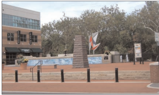
O.G.C.P. Mission Statement

Shop ♦ Dine ♦ Play Olde Gahanna ♦ Creekside