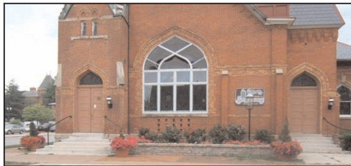
Olde Gahanna Sanctuary 82 North High Street