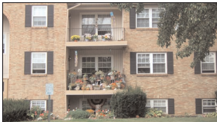
101 North High Street