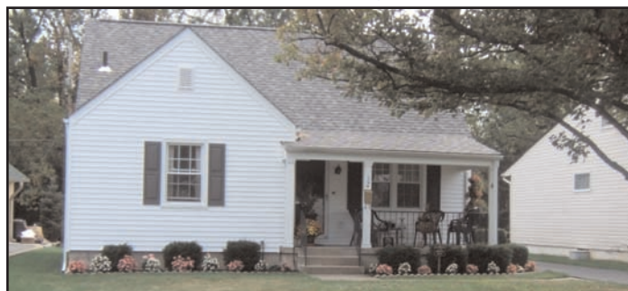
104 Shull Avenue